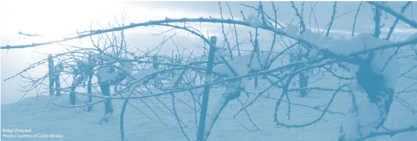
Ridge Vineyard