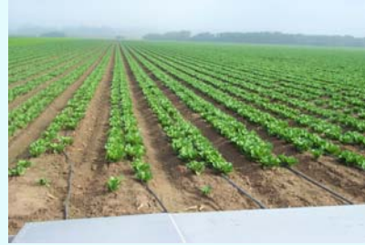
Cupping 10-20 lbsN/wk