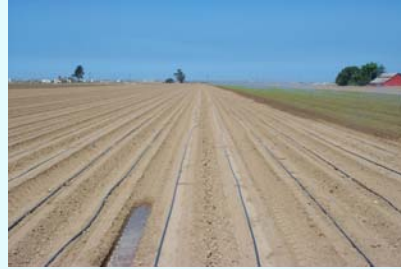
Lettuce Germination with Drip