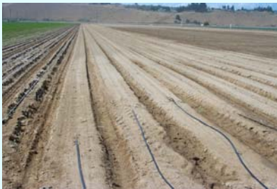
Lettuce Germination with Buried Drip Tape