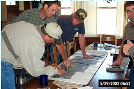
Farm Water Quality Management Plan for 2005