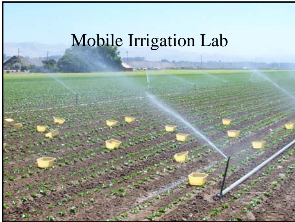
Mobile Irrigation Lab