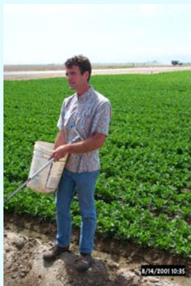
Check Irrigation Water for Nitrate