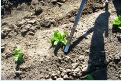
Early Growth 5-10 lbsN/wk