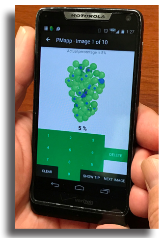
Area assessment training.