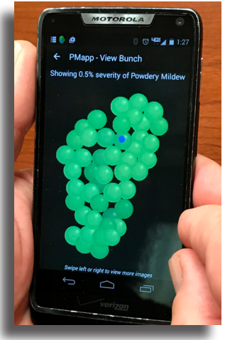
Using the diagrammatic key.