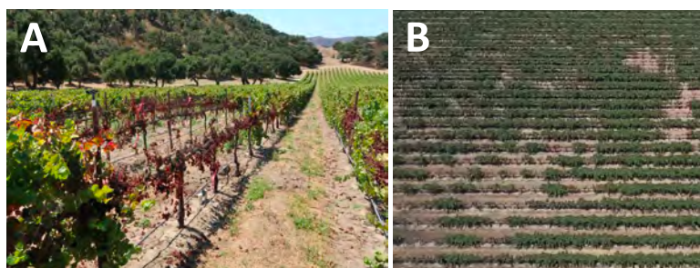
Figure 1. Sudden vine collapse in Paso Robles, CA (A). Patches of collapsed vines during summer 2019 in Lodi, CA (B).