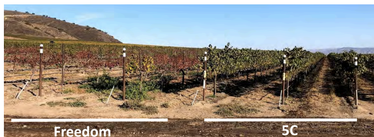
Figure 4. SVC on vines grafted on Freedom but not on 5C rootstocks.