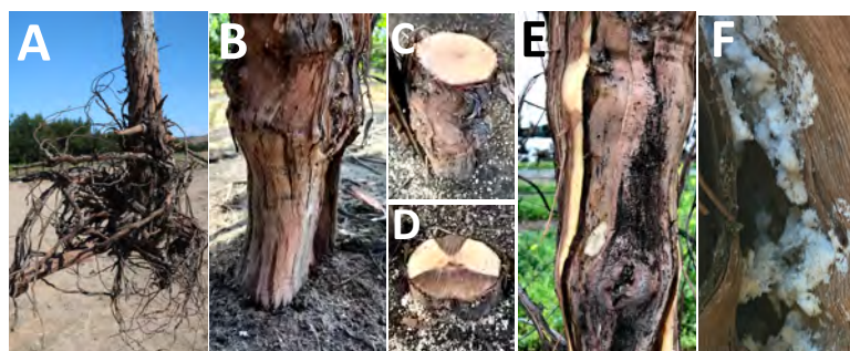
Figure 3. Lack of feeder roots (A). Swelling and cracking on graft union bark (B). Scion cut with asymptomatic wood (C). Rootstock cut with cankered wood (D). Reproductive structures (pycnidia) of Neofusicoccum parvum on the bark, serving as inoculum source of the trunk diseases Botryosphaeria canker and dieback (E), Large colonies of mealybugs under the rootstock bark observed in all collapsed vines (F).